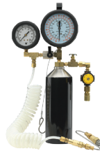
Complete Intake/Fuel Rail Device Part No. VP055