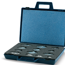
EGR Adapter Set* Part No. 887872