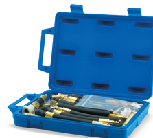
Light/Medium Duty Diesel Adapter Set* Part No. 887888