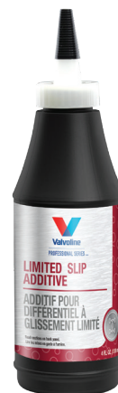
Limited Slip Additive (Part No. VP011, 4 fl. oz.)