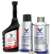
3 Part Fuel System Kit