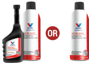
Fuel Rail Injection Services Part No. 666725 Part No. VP076 2-Part Kit