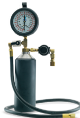
EGR Canister Tool Part No. 873110