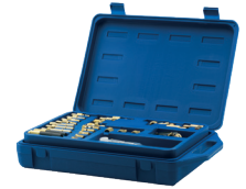
Fuel Rail Adapter Set