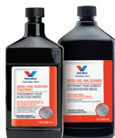
Heavy Duty Diesel Fuel Rail Kit Part No. VP206