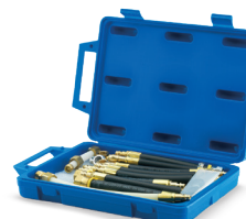
Heavy Duty Diesel Adapter Set* Part No. 887886