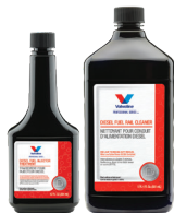
Light Duty Diesel Fuel Rail Kit Part No. VP205