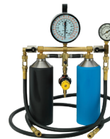
Dual Canister Tool