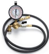
Fuel Rail Device with Gauge Part No. 872447