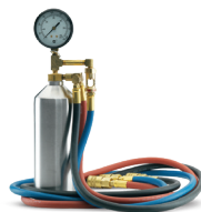
Diesel Fuel Rail Canister* Part No. 887884