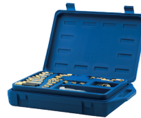
Fuel Rail Adapter Set Part No. 863637