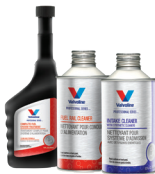
3 Part Plus Fuel System Kit